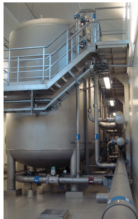
Water treatment plant in Alveim, Norway

The tenth ozone bio-filtration plant 'made by Hydro-Group' with closed filter vessels has been operating successfully for about 10 months. The system, which can be extended to 90 l/s, has currently been increased with three parallel filters (D = 3.2 m) to a capacity of 50 l/s. The system is equipped to Hydro standard with two independent oxygen production and two independent ozone production lines, each configured for full load. This guarantees a very high level of system availability at all times.